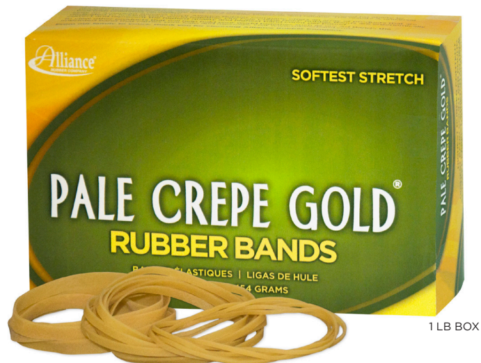
1 LB BOX