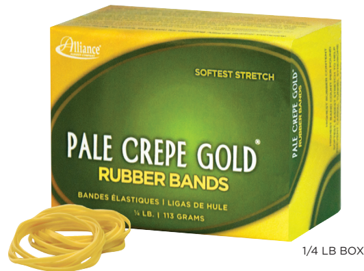
1/4 LB BOX

Pale Crepe Gold can help minimize workers comp expenses caused by repetitive banding. These bands put less stress on the hands and wrist and therefore can reduce the risk of Carpal Tunnel Syndrome or other trauma disorders.